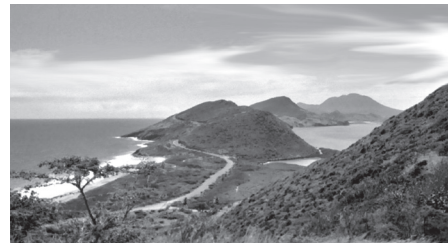
North and South Friars Bays, St. Kitts

This peaceful little paradise in the Caribbean's chain of Leeward Islands is a respite from some of the more frenetic islands. The island is dominated by the 3,792-foot-tall Mount Liamuiga (say "Lee-a-mweega"), a dormant volcano carpeted by dense tropical forests.